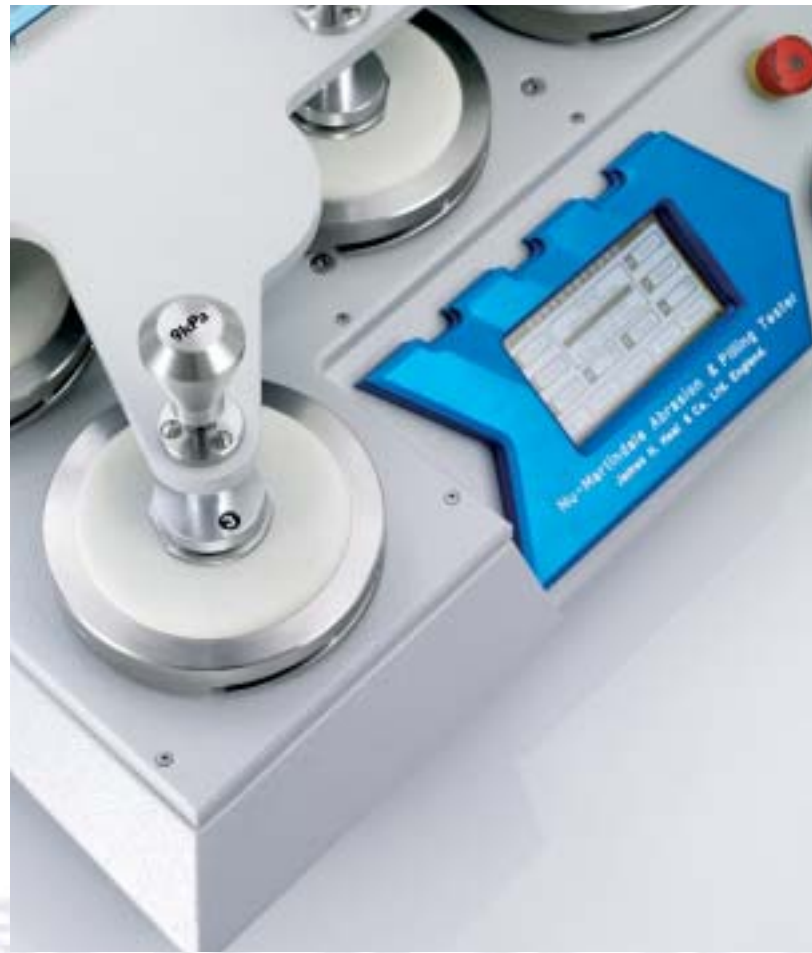
ABRASION STATION KIT (9 OR 12 kPa WEIGHT)

Each type of test requires a different Station Kit . You need to decide how many of each you require. If your needs change, it's not a problem - all three types can be purchased subsequently.