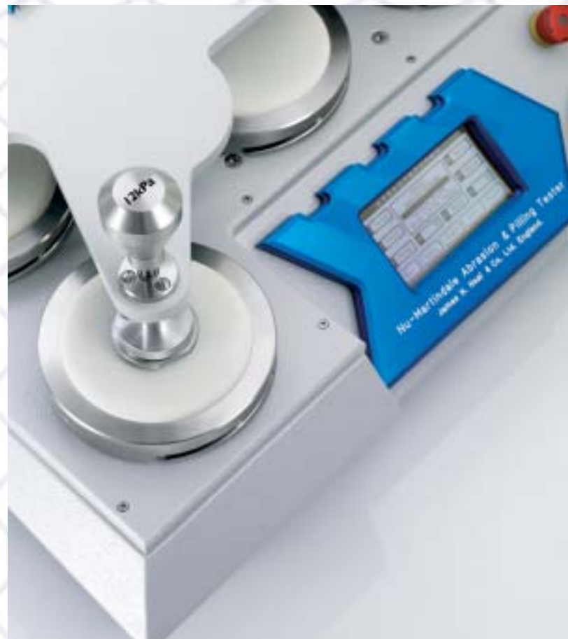
SOCK ABRASION STATION KIT (12 kPa WEIGHT)