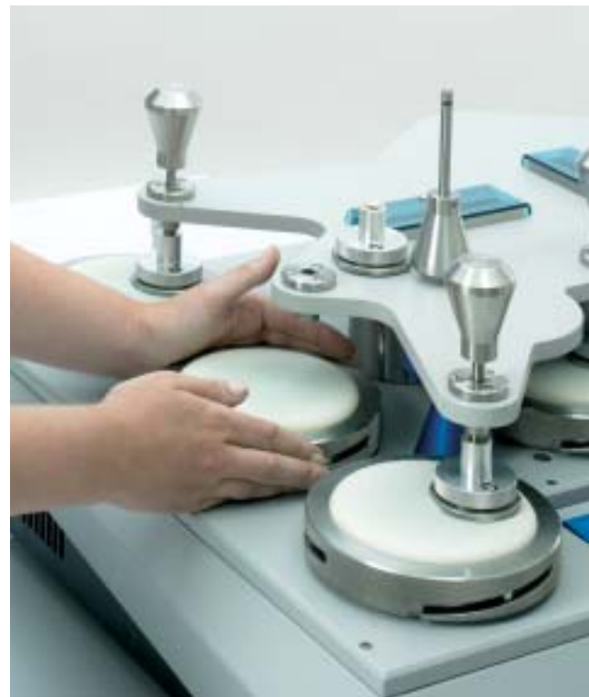
EASY ACCESS TO ABRADING TABLES