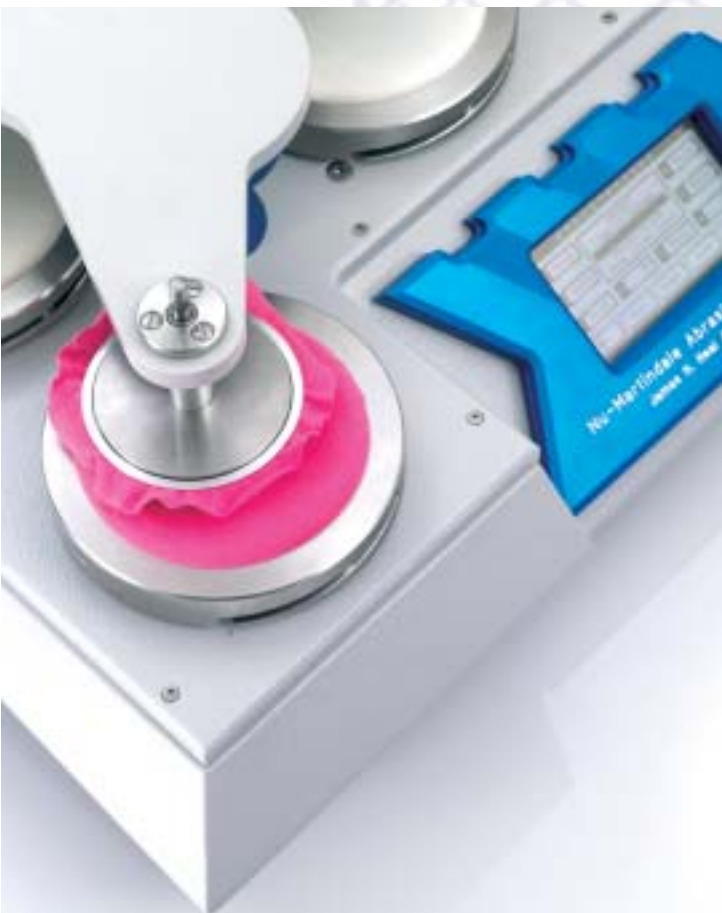
PILLING STATION KIT