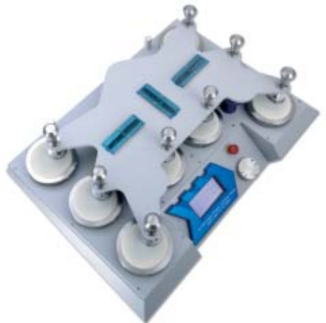
TOP PLATE PARKED ON THE RIGHT, FULLY EXPOSING ABRADING TABLES ON THE LEFT