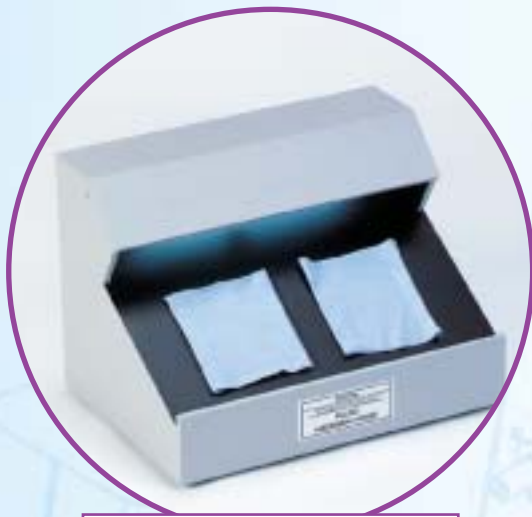
PILLING ASSESSMENT VIEWER