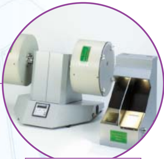
ORBITOR & HOLOSCOPE